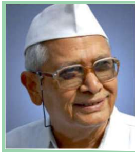
DR. EKNATHRAO ALIAS BALASAHEB VIKHE PATIL