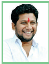
Hon'ble Shri. Dr. Sujay Vikhe Patil

Chief Executive Officer- DVVP Foundation, Ahmednagar.